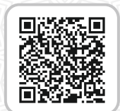
Sample Score Improvement Solution

*The fees mentioned above is inclusive of GST. *Post-Prelims UPSC CSE 2026 tests are available only to students enrolled in the MTS P2M program.