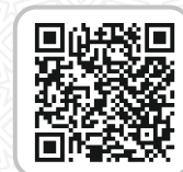
Scan to Enroll MTS 2.0

The process is more important than the results. And if you take care of the process, you will get the results.