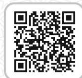
CSE 2023 & 2024 Toppers Copies