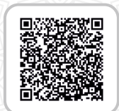
CSE 2024 & 2025 Mains Reflections