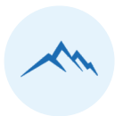
Peak Score by Attempts