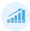
Questions by Subjects