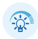
Questions by Difficulty