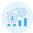
Your Score Per Subject vs Average Score