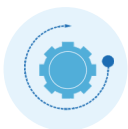
Tabular Representation of Relative Performance