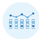
Subject Wise Attempts and Performance