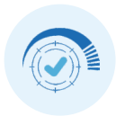
Most Difficult Questions Attempted Students Score