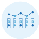
Your Attempts by Subjects