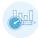
Difficulty Assessment on Relative Performance