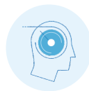
Question Wise Top Distractor