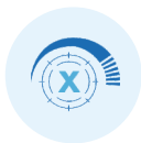
Least Solved Questions